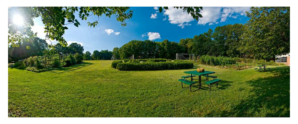
The Riverside Elementary School garden.

This chapter can be linked to the Career Planning and Consumer and Family Life Skills 9.2.